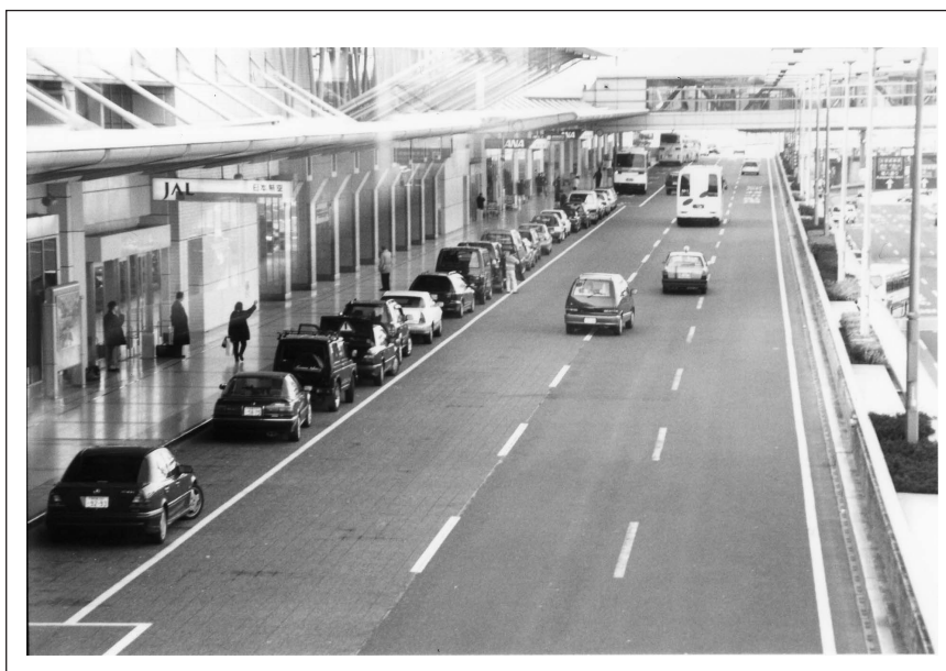
airport terminal, so

You will have eight minutes to complete this part of the test.